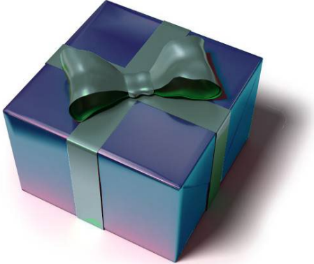
Charity/The Lords Work